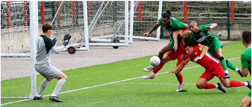
Late pressure as Belper United go for the win